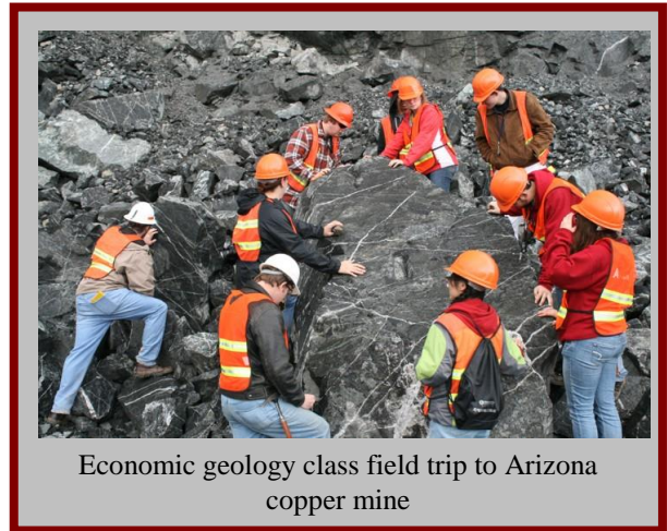
Economic geology class field trip to Arizona copper mine