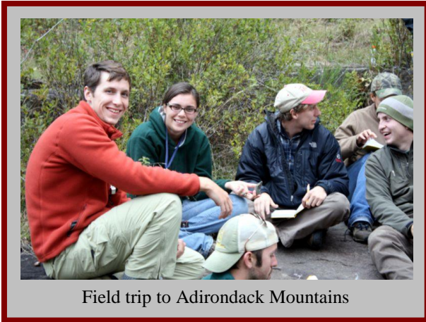
Field trip to Adirondack Mountains

The B.S. Degree in Geology is designed for students anticipating graduate work or direct employment, ultimately as professional geologists. The degree requires a solid foundation in geology, chemistry, physics, and mathematics.